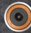
Strip & Corners